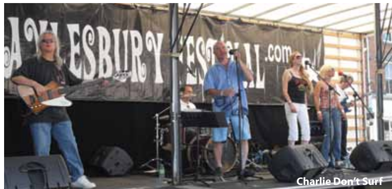
Charlie Don't Surf