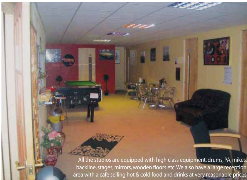
All the studios are equipped with high class equipment, drums, PA, mikes, backline, stages, mirrors, wooden floors etc. We also have a large reception area with a cafe selling hot & cold food and drinks at very reasonable prices

Please tell our readers all about West Star Studios (High Wycombe), and please introduce yourselves.