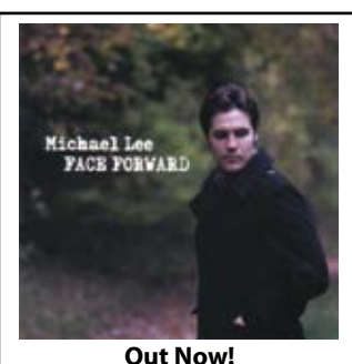
Out Now! www.myspace.com/michaelleeuk

www.blackwaterproductions.co.uk www.sleepercellproductions.com